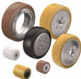
ELECTRIC STACKER / REACH TRUCK WHEEL