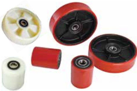
HAND PALLET TRUCK WHEEL (PU/NYLON)