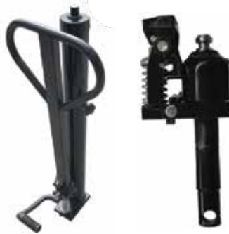
HYDRAULIC PUMP FOR HAND PALLET TRUCK & STACKER