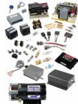
ELECTRICAL & ELECTRONICS PARTS