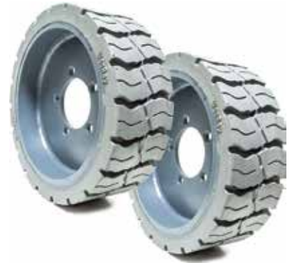
SCISSOR LIFT WHEEL